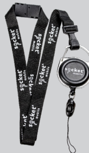
Lanyard - Black AC4100-1692