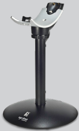
Charging Stand SKU# AC4076-1538