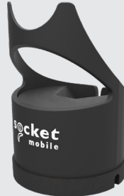
Charging Dock SKU# AC4133-1871